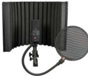
Portable soundproofing and pop shield

However good the microphone, you need to ensure a good quality signal. That means positioning the mic 4 or 5 inches away from whoever is speaking and setting the input level on your computer or recording device as high as you can without suffering 'clipping' (digital overload) when someone speaks loudly.