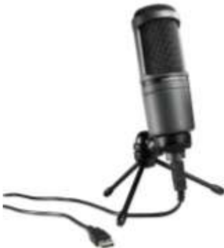
USB condenser mic

Although almost any microphone will deliver reasonable results when recording speech, it pays to use a decent one. Assuming you don't want to hand hold the mic and you're recording directly to a computer, then you should look at a USB condenser mic. There are now lots available and you shouldn't have to pay over $100. It pays to add a pop shield, an inexpensive accessory that stops the signal level exploding whenever the letter 'p' is spoken (and yes, this does make a real difference). If you want to get recording studio quality, you might also purchase portable soundproofing materials for deadening the sound. See Soundproofing and acoustics for podcasters .